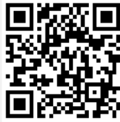
User Manual e-Request